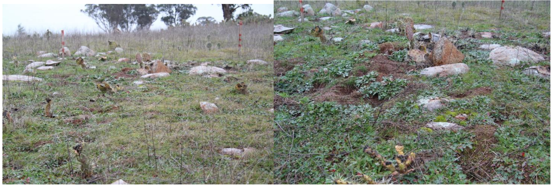
4 month follow up 2 July 2014