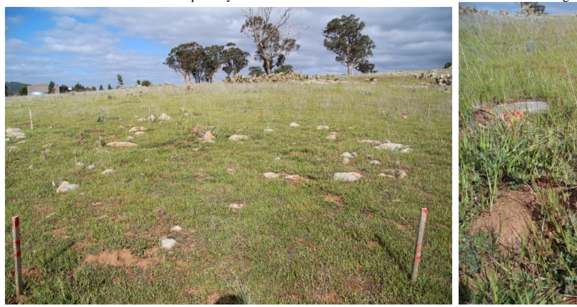
Damaged and dying plants 4 months after spray